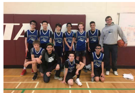
Intermediate Boys Basketball